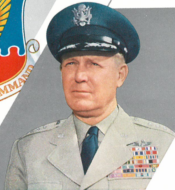
GEN. O. P. WEYLAND Commander USAF Tactical Air Command