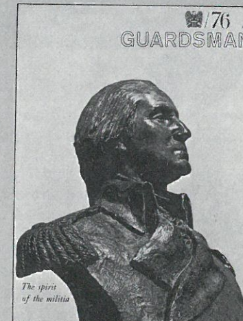
Bust of George Washington at National Guard Memorial conveys the courage and will that sparked the spirit of the militia.

THE NATIONAL GUARDSMAN is published monthly, except August, by the National Guard Association of the United States, with editorial and advertising offices at 1 Massachusetts Avenue, N.W., Washington, D.C. 20001. Telephone (202) 347-0341. Second class postage paid at Washington, D.C., and at additional mailing offices. Copyright 1976 by the National Guard Association of the U.S. All rights reserved. All members of the NGAUS receive the GUARDSMAN. Nonmember subscriptions: $3 per year domestic; $4 per year foreign. Bulk rate for 100 or more copies to the same address: $2.50 each. Single copies 50¢. The GUARDSMAN welcomes original articles bearing on national defense, with emphasis on the National Guard. Manuscripts and artwork must be accompanied by return postage; no responsibility is assumed for safe handling. Opinions expressed by authors do not necessarily represent official NGAUS positions or policy. Likewise, publication of advertising cannot be deemed an endorsement thereof by this Association or its members.