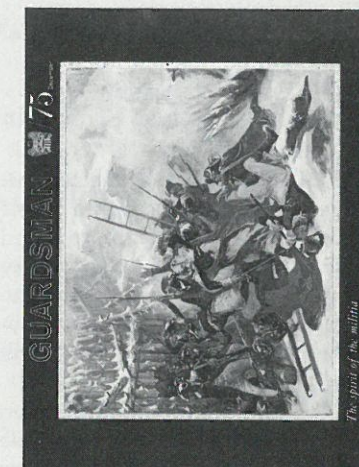
Although he was not a militiaman, General Montgomery likely would have become one of Washington's great field commanders in the Revolutionary War. His death during the attack on Quebec, as depicted in this painting by Alonzo Chappel, was a real blow to the spirit of the militia.

THE NATIONAL GUARDSMAN is published monthly, except August, by the National Guard Association of the United States, with editorial and advertising offices at 1 Massachusetts Avenue, N.W., Washington, D.C. 20001. Telephone (202) 347-0341. Second class postage paid at Washington, D.C., and at additional mailing offices. Copyright 1975 by the National Guard Association of the U.S. All rights reserved. All members of the NGAUS receive the GUARDSMAN. Nonmember subscriptions: $3 per year domestic; $4 per year foreign. Bulk rate for 100 or more copies to the same address: $2.50 each. Single copies 50¢. The GUARDSMAN welcomes original articles bearing on national defense, with emphasis on the National Guard. Manuscripts and artwork must be accompanied by return postage; no responsibility is assumed for safe handling. Opinions expressed by authors do not necessarily represent official NGAUS positions or policy. Likewise, publication of advertising cannot be deemed an endorsement thereof by this Association or its members.