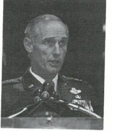
Annual Report to the General Conference