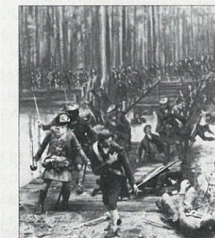
The spirit of the militia

The spirit of the militia was lifted after North Carolina Patriots stopped Tory Highlander troops in the Battle of Moore's Creek Bridge, as depicted in this diorama of the ill-fated attack (see page 2).