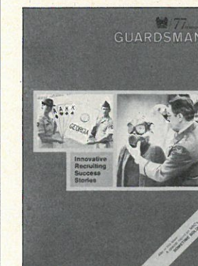
Photo contest winners back cover

NGAUS Executive Council inside back cover How to contact your representatives.