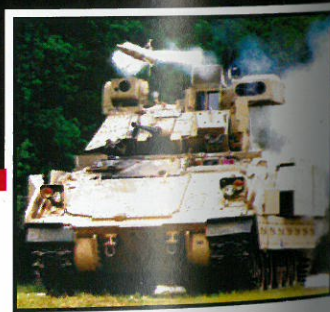
Key to Army 2010 and beyond, the Bradley A3 incorporates advanced digitized systems with software and electronics for enhanced lethality and situational awareness.

Good training is key to soldier performance. But there are never enough ranges, labs, or time to train, until now. The Bradley A3 with embedded "Virtual Range" provides realistic training simulations for the individual or crew. The Army's first integrated platform design revolutionizes training and improves performance. Now you and your Bradley team can realize your full potential with a self-contained, fully interactive, digital simulator — whether you're in the motor pool or deployed in the field.