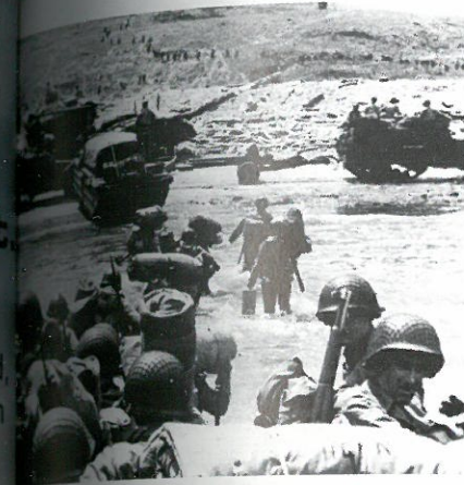
Cover: Color photo by Mark Furam. Others courtesy National Guard Bureau archives.

Dusty, gritty and armed to the teeth: you won't find these guys in the Army or Marine Corps. The Air Force has its own set of grunts. They're every bit as lethal as a Green Beret on recon or an Airborne Ranger. See how the Air Force protects itself, by itself. Bring along your Kevlar.