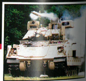
Key to Army 2010 and beyond, the Bradley A3 incorporates advanced digitized systems with software and electronics for enhanced lethality and situational awareness.

Good training is key to soldier performance. But there are never enough ranges, labs, or time to train, until now. The Bradley A3 with embedded "Virtual Range" provides realistic training simulations for the individual or crew. The Army's first integrated platform design revolutionizes training and improves performance. Now you and your Bradley team can realize your full potential with a self-contained, fully interactive, digital simulator — whether you're in the motor pool or deployed in the field.