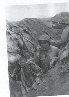
ABOUT THE COVER Behind the outline of the Korean peninsula on the cover is a photograph of an Oklahoma Army National Guard forward observer calling for artillery during 1952 fighting in Korea.