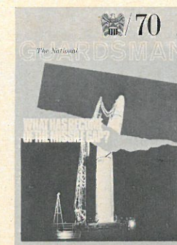
"Exploded" missile gap of the early 1960s may be taking shape again, despite artist's optimistic rendition.

A professional debunks the notion that good National Guard public relations is a mystery.