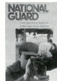
COVER: A CF-4 team member surveys a runway for specifications. Cover design by Tom Powers of Bill Duffy and Associates.

NATIONAL GUARD, November 1981. The NATIONAL GUARD Magazine (ISSN 0163-3945) is published monthly, by the National Guard Association of the United States, with editorial and advertising offices at One Massachusetts Avenue, N.W., Washington, D.C. 20001. Telephone (202) 789-0031. Second class postage paid at Washington, D.C., and at additional mailing offices. Copyright 1981 by the National Guard Association of the U.S. All rights reserved. All members of the NGAUS receive NATIONAL GUARD. Nonmember subscriptions: $4 per year domestic; $5 per year foreign. Bulk rate for 100 or more copies of one issue to the same address: 25¢ each. Single copies 50¢. The Editor welcomes original articles bearing on national defense, with emphasis on application to or implications for the National Guard. Manuscripts and artwork must be accompanied by return postage; no responsibility is assumed for safe handling. Opinions expressed by authors do not necessarily represent official NGAUS positions or policy. Likewise, publication of advertising cannot be deemed an endorsement thereof by this Association or its members.