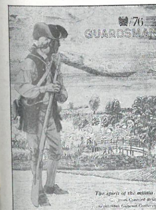
The spirit of the militia is depicted on this month's front cover by a symbolic militiaman — representative of all National Guardsmen who have served since even before the battle at Concord Bridge. (Cover composit from sketches by Lou Nolan and Amos Doolittle.)

THE NATIONAL GUARDSMAN is published monthly, except August, by the National Guard Association of the United States, with editorial and advertising offices at 1 Massachusetts Avenue, N.W., Washington, D.C. 20001. Telephone (202) 347-0341. Second class postage paid at Washington, D.C., and at additional mailing offices. Copyright 1976 by the National Guard Association of the U.S. All rights reserved. All members of the NGAUS receive the GUARDSMAN. Nonmember subscriptions: $3 per year domestic; $4 per year foreign. Bulk rate for 100 or more copies to the same address: $2.50 each. Single copies 50¢. The GUARDSMAN welcomes original articles bearing on national defense, with emphasis on the National Guard. Manuscripts and artwork must be accompanied by return postage; no responsibility assumed for safe handling. Opinions expressed by authors do not necessarily represent official NGAUS positions or policy. Likewise, publication of advertising cannot be deemed an endorsement thereof by this Association or its members.