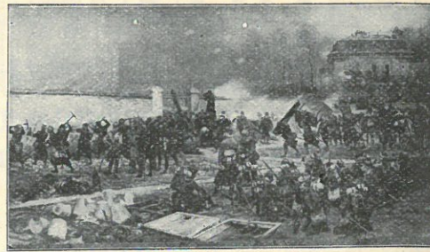
DEFENCE OF CHAMPGNY —Detaille

We have reproduced from photographs of the original paintings in the Metropolitan Museum of Fine Arts, New York City, these two stirring battle scenes, which are printed on the finest of artists' plate paper in duo-tone ink. They are just the thing for armory or den. We send them flat, postpaid, and ready for framing or mounting for 25 cents each.