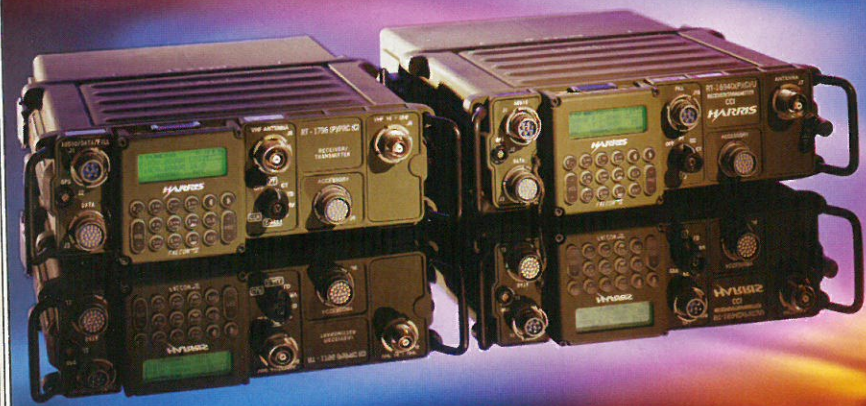
Powering the future of TACTICAL radios

Success on the battlefield depends on communication that's clear and uncompromised. Warfighters need high-speed access to critical information without delay. That's why defense forces worldwide depend on Harris' FALCON® II family of software-defined, tactical radios.