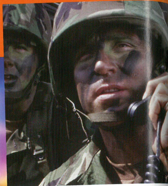
Visit us at TechNet Tampa booth 51